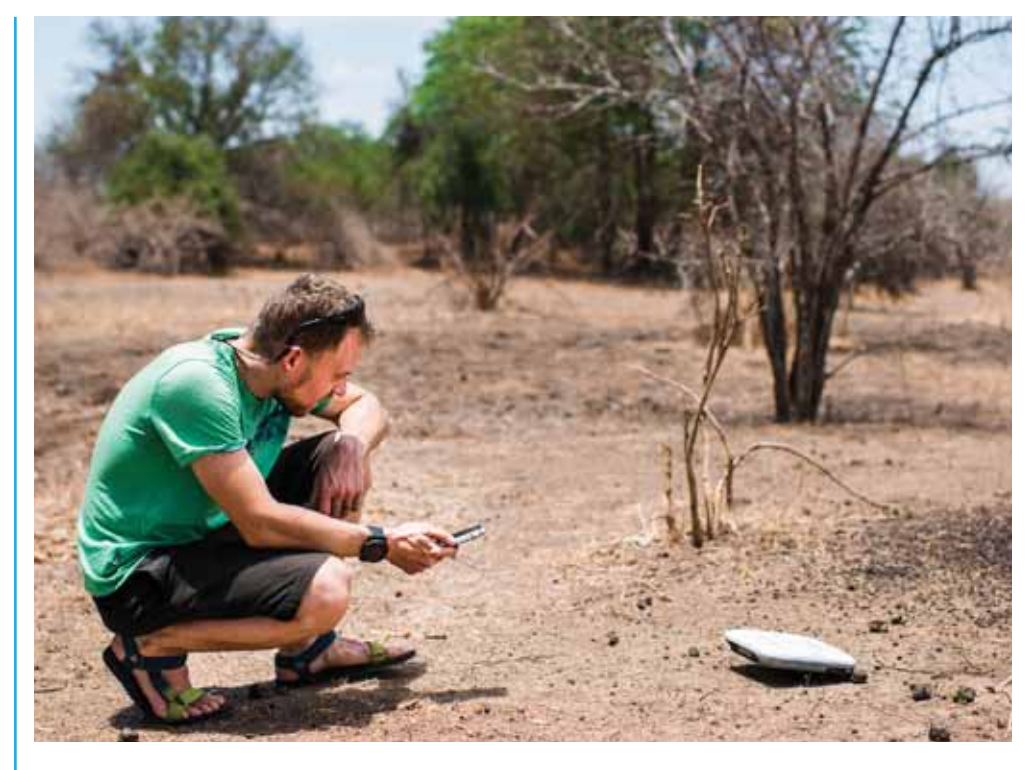
"We were actually very pleased to see them because one was a large male we had been trying to locate for a long time."