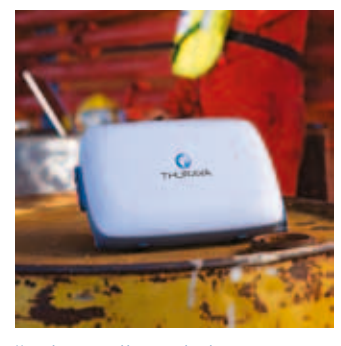
"A broadband data capability is essential for maintaining daily contact with colleagues on shore and the IP terminal is incredibly easy to set up and use,"

www.thuraya.com | www.shapadu.com.my | www.radii.com.my