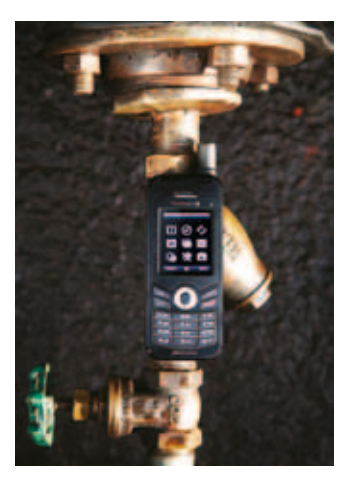
"It really is a great phone with really good voice quality. I'd recommend it to anyone who needs to make and receive calls from remote areas."

Offshore contracting crews working in the harsh environment of the South China Sea rely on Thuraya XT and IP for reliable communications