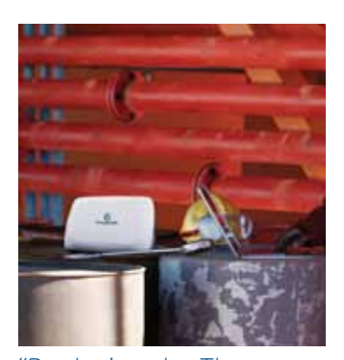
"Deploying the Thuraya IP has allowed us to provide broadcast video streams at an economically feasible cost to our clients."